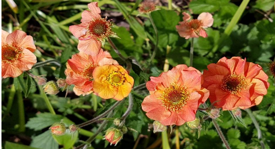
Geum Totally Tangerine in flower 10 months of the year!