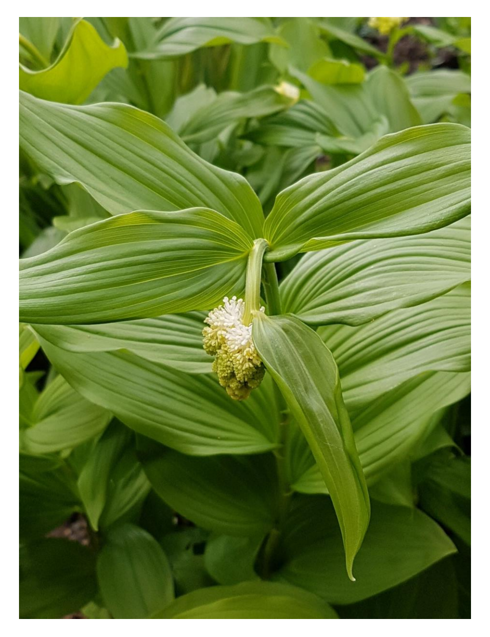
All photos in this newsletter taken in Whitcombe House garden.

https://natureinart.org.uk/ Tel. 01452 731422